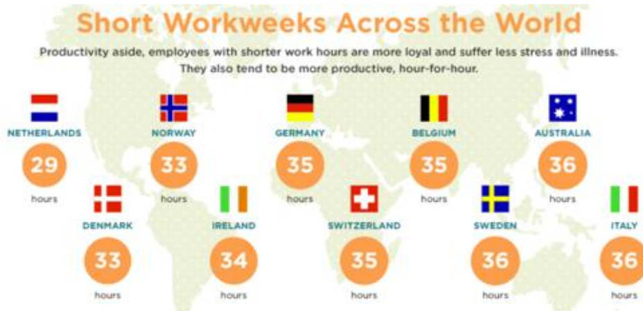
Figure 7: Average Workweek Lengths across the World (PGI 2015)