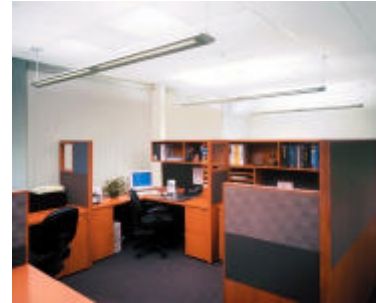
Figure 3: Indirect Light Fixtures Installed (Finelite 2001)