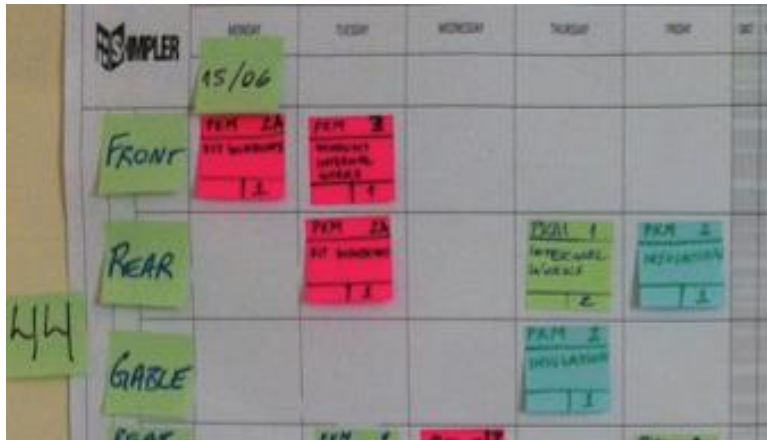
Figure 1: Post-it notes fixed on a location-based chart at the site office (master plan).

As illustrated in the table above, the master plan and phase planning were devised simultaneously due to the characteristics of the project, namely, a retrofit of small houses planned to be executed in short amount of time. In this paper, such plan will be referred as “master plan”. It was devised by the delivery team through the use of post-it notes fixed on a chart at the site office as showed in the following figure.