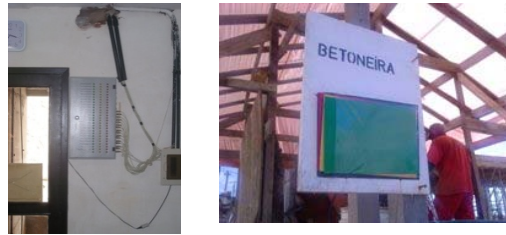
Figure 2: Two Different Andon Systems

Although it is an achievement to give the worker the power to stop production in case of disruptions in the input flow, the essence of the andon system is to identify and ultimately solve the real cause of a disruption through continuous improvement efforts. The site manager of a company that is known to have been advanced in process transparency in Fortaleza complained that they struggled in identifying the real cause of a disruption. The level of continuous improvement seems an issue that needs to be improved by the management in these companies.