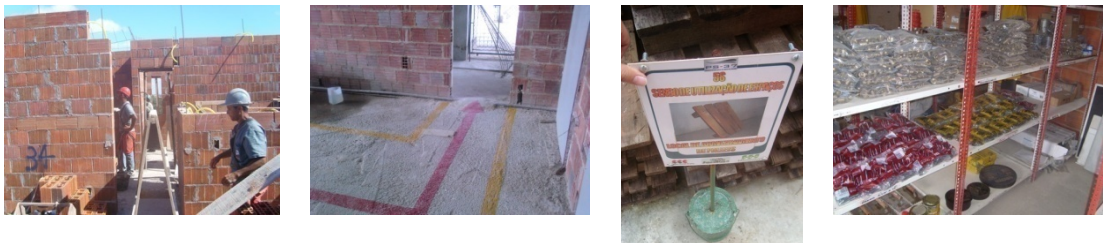
Figure 11: Maintaining a Clean and Orderly Workplace

In order to maintain a clean and orderly workplace, people on the site are identified by using colour coded helmets, locations of materials stored on the site are standardized by putting the material's photo and technical specifications on display, just in front of the storage location (by that way, the corresponding material is not stored anywhere else but the identified location), construction end products (houses, walls, columns etc) are identified with numbers and/or names, a great deal of importance is given to the site warehouse organization, transportation routes (flow routes) – with direction marks on the surface- and transportation means (generally standard sized hand barrows) are visually identified, regular site cleaning and colour coded waste containers for recycling are observed to be in practice (see Figure 11).