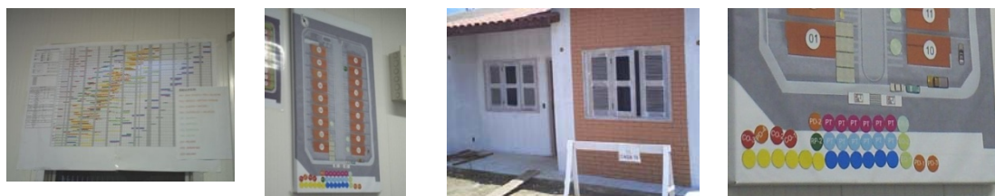
Figure 9: Transparency for Different Groups

Sometimes the level of transparency, sufficient for a group of people, may not be comprehensible enough to interpret by another group. In one case, a colour coded line of balance production scheduling was communicated over a magnetic board devised by the management to increase the communication ability for the workers (see Figure 9).