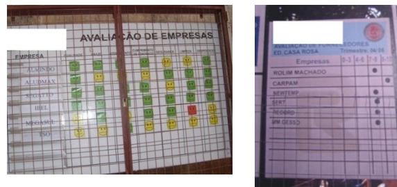
Figure 12: Subcontractor/ Supplier Evaluation Boards

In one of the contractor companies, the site manager stated that the "near miss" metric (safety) and the corresponding near-miss bench to record near miss events were not working as intended. Later, it was identified through discussions with the local academics working closely with the company that the owner of the building (the client) had not been demanding enough for near-misses, as one the contractor's safety performance criteria, to raise attention for the metric in the company. This can be noted as the effect of an external factor on process transparency.