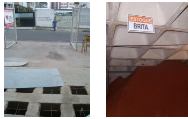
Figure 4: A Layout Organisation by the Foreman

order. The foreman stated that he had observed that the cleanliness and order on the site had a positive impact on visitors' and the public's perception of the company (see Figure 4).