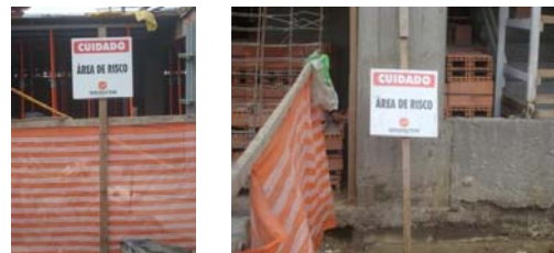
Figure 5: The Mobile Signs

Signage is typically used to identify spatial elements including the construction end products (e.g. building, floor, beams, columns etc) and temporary construction production units (e.g. workstations, warehouses etc). In one company, mobile signs that warn against “possible fall” on the location were identified. Examples of this kind of mobile signage were scarce (see Figure 5).