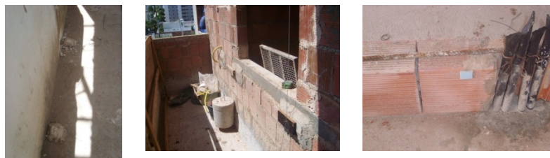
Figure 8: Traditional Work Facilitators

Some traditional methods as visual aids, generally on the floor, facade and walls to give a direction (e.g. the direction of floor tiles) and a level (e.g. the thickness of the floor screed, wall plaster or facade elements) of reference for production are still in use in the companies visited (see Figure 8).