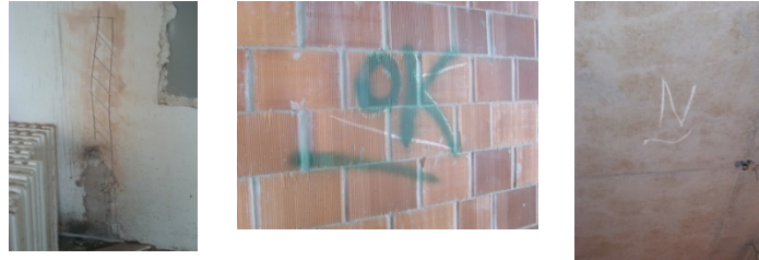
Figure 7: Improvised Process Transparency

Integrating information into the working environment is sometimes spontaneous. Several practices that resulted from improvisations were observed on construction sites (see Figure 7). In fact, these are more frequently seen as part of quality check or quality assurance efforts. In one company, it was revealed that a worker team had devised a colour coded communication system for processed pipes, which was even unknown by the site management.