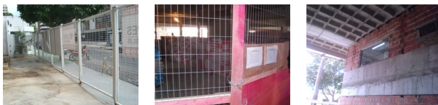
Figure 3: Making the Process Directly Observable

Site layout and fencing should support transparency well. The main function of these items is to provide transparency through making processes observable and enabling information flow. Glass as a translucent material is used for increased transparency on the perimeter walls and doors of the site office buildings. Increased transparency through glass is also used for marketing purposes to display a maquette of the completed project to potential customers. The frequently preferred fencing types are those which permit seeing and being seen through, along with providing a safe enclosure, such as chain link or welded wire fences. Site perimeters, warehouses, allocated areas (e.g. dining areas, elevator control rooms, workstations and material storage zones etc) are deliberately enclosed with those specific types of fences, where climate and construction conditions permit (see Figure 3).