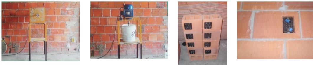
Figure 1: On-Site Prefabrication and Reducing Interdependence

This principle was most frequently observed in the pre-assembly of the electrical junk box on brick units before brick layering. The on-site prefabrication of the mortar at a specifically designed station, in order to guarantee homogeneity for a high quality mixture, was also documented in one company (see Figure 1).