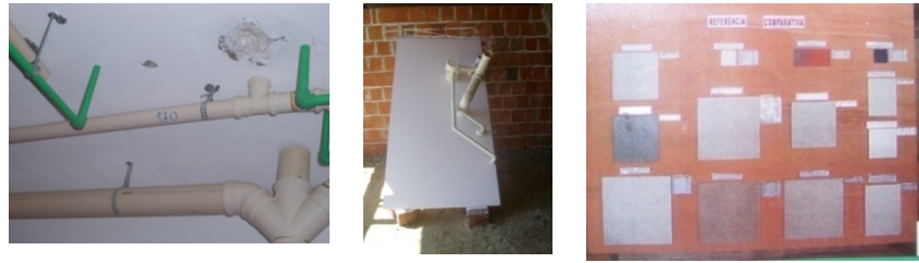
Figure 10: Prototyping and Sampling

In some cases, the process information that could act as a visual aid/ facilitator was misplaced; far from where the information need actually occurs. In one company for example, a process chart was located next to the site office, instead of the production area where the chart is needed for production.